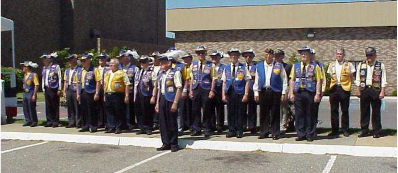
estimated to be from 2007