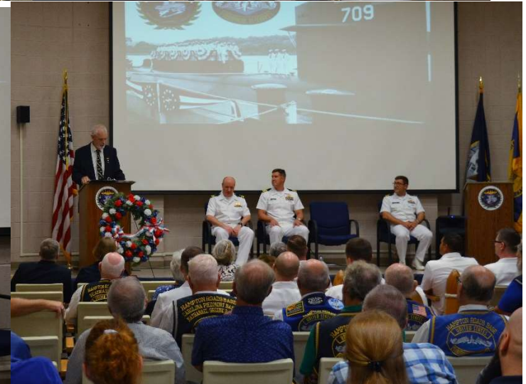
2022 Ceremony Pictures