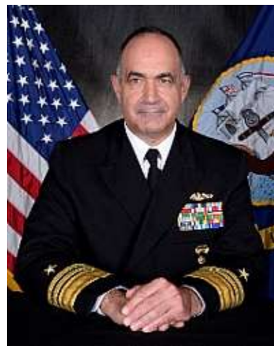
VADM Charles Richard

There is an extensive article from Undersea Warfare News on page __ that covers the event in depth. Please read the article if you want to know more about the new top submariner.