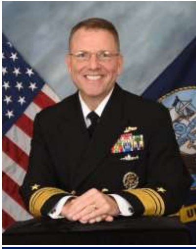
VADM Joseph Tofalo

To watch the video of the ceremony, visit go to Facebook: http://www.facebook.com/sublant/