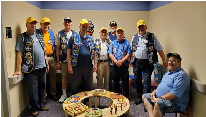
After Action Muster