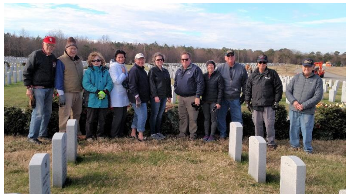
Team HRB and others, but not all others