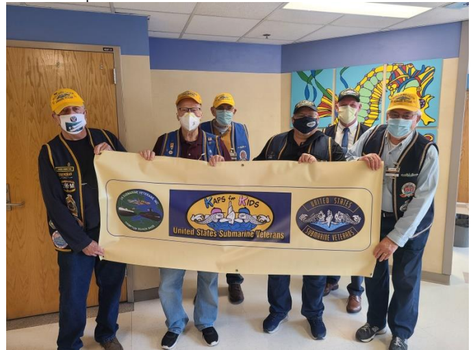
March 2022 Visit

Here are photos from our last two visits: