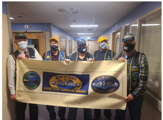
April 2022 Visit